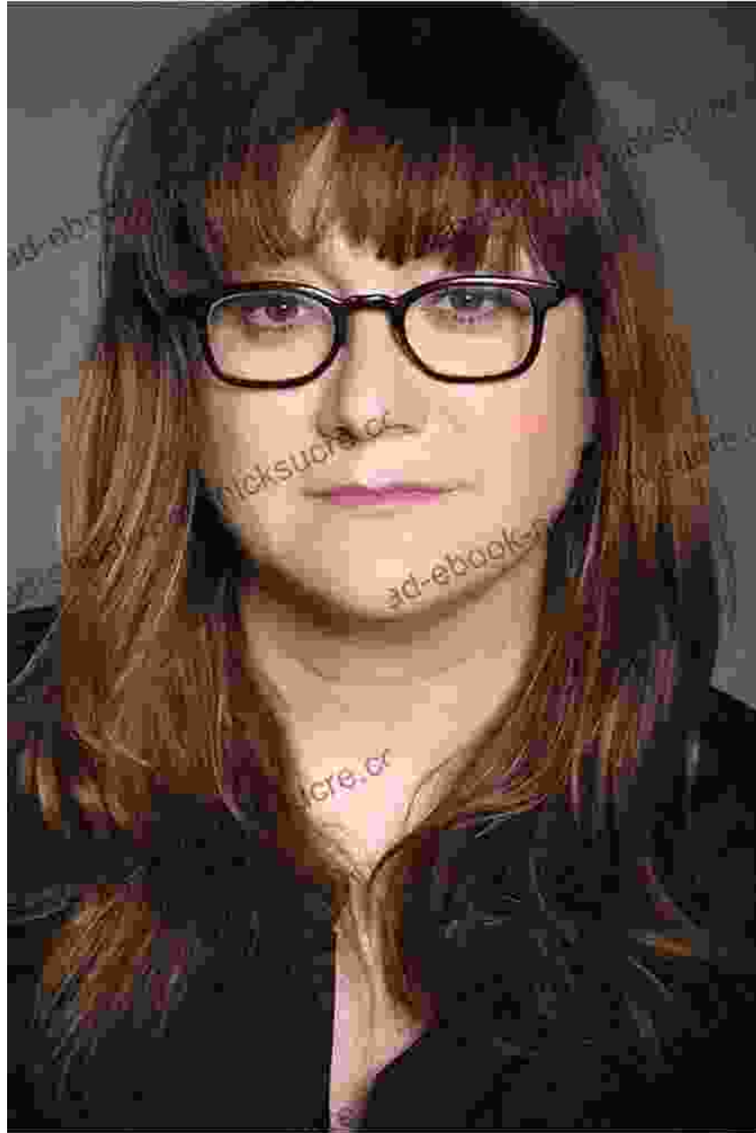
Isabel Coixet, Spanish screenwriter and director

Isabel Coixet is a versatile Spanish screenwriter and director whose films often deal with female identity, cultural issues, and the search for personal fulfillment.