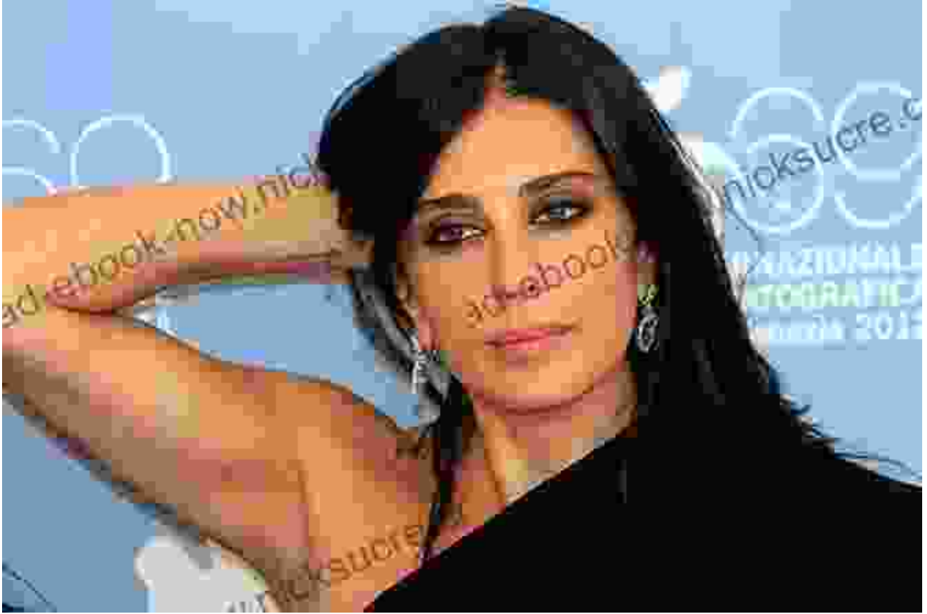
Nadine Labaki, Lebanese screenwriter and director

Nadine Labaki is a multi-talented Lebanese screenwriter and director. Her films often explore themes of family, social justice, and women's rights.