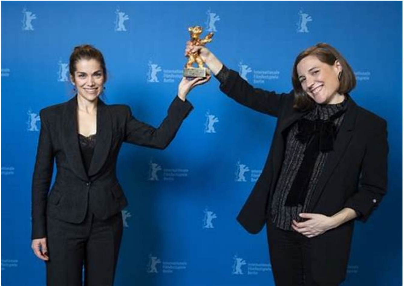
Carla Simón, Spanish screenwriter and director

Carla Simón is an emerging Spanish screenwriter and director whose work focuses on family relationships, childhood, and the complexities of female identity.