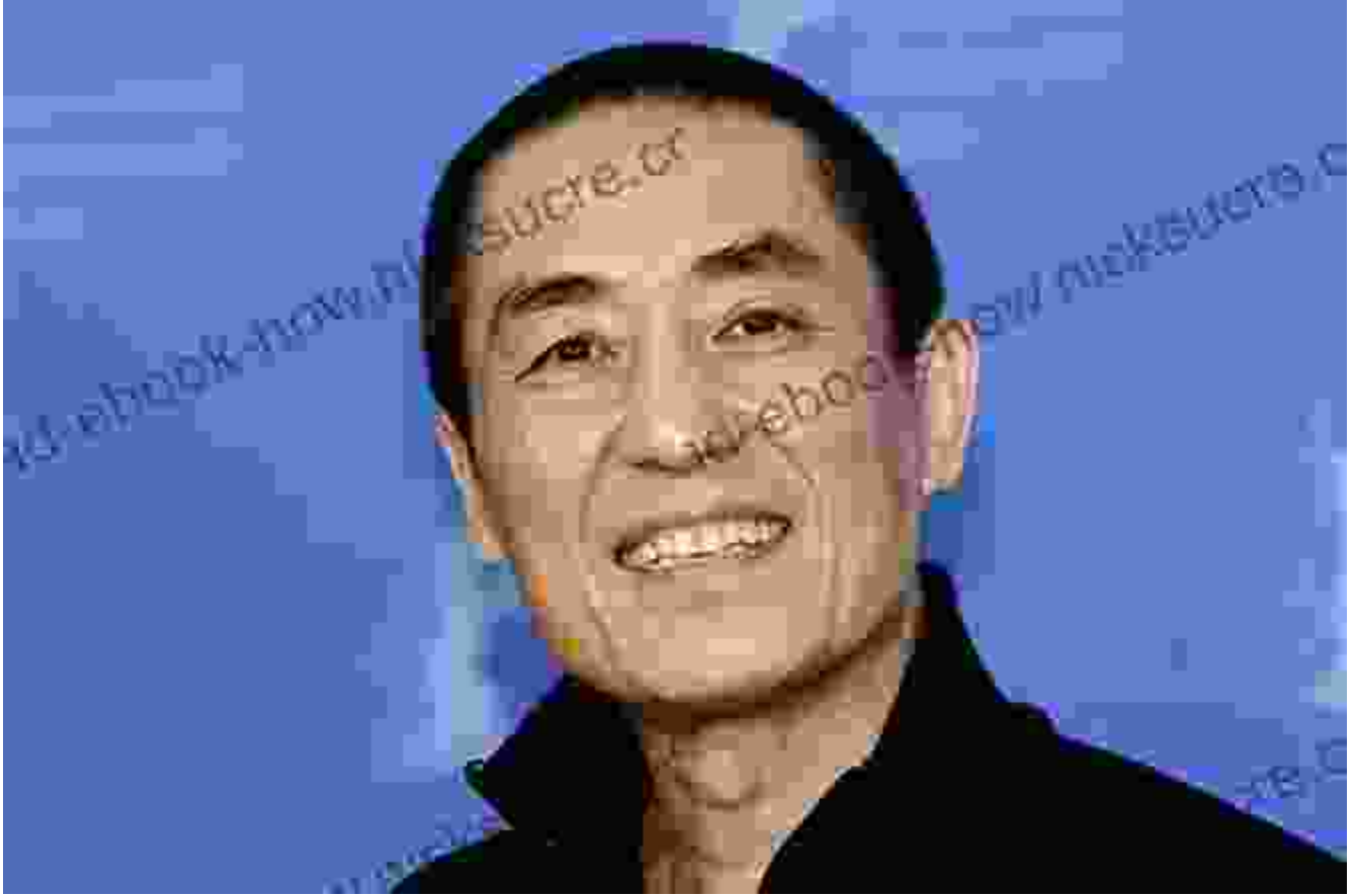
Zhang Yimou, Chinese screenwriter and director

Zhang Yimou is a prominent Chinese screenwriter and director known for his visually stunning films. His work often explores themes of history, tradition, and women's experiences.