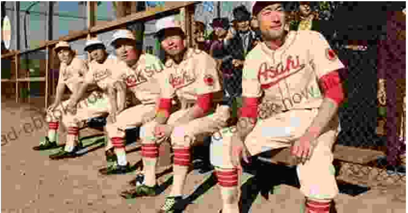
The Vancouver Asahi baseball team playing a game.