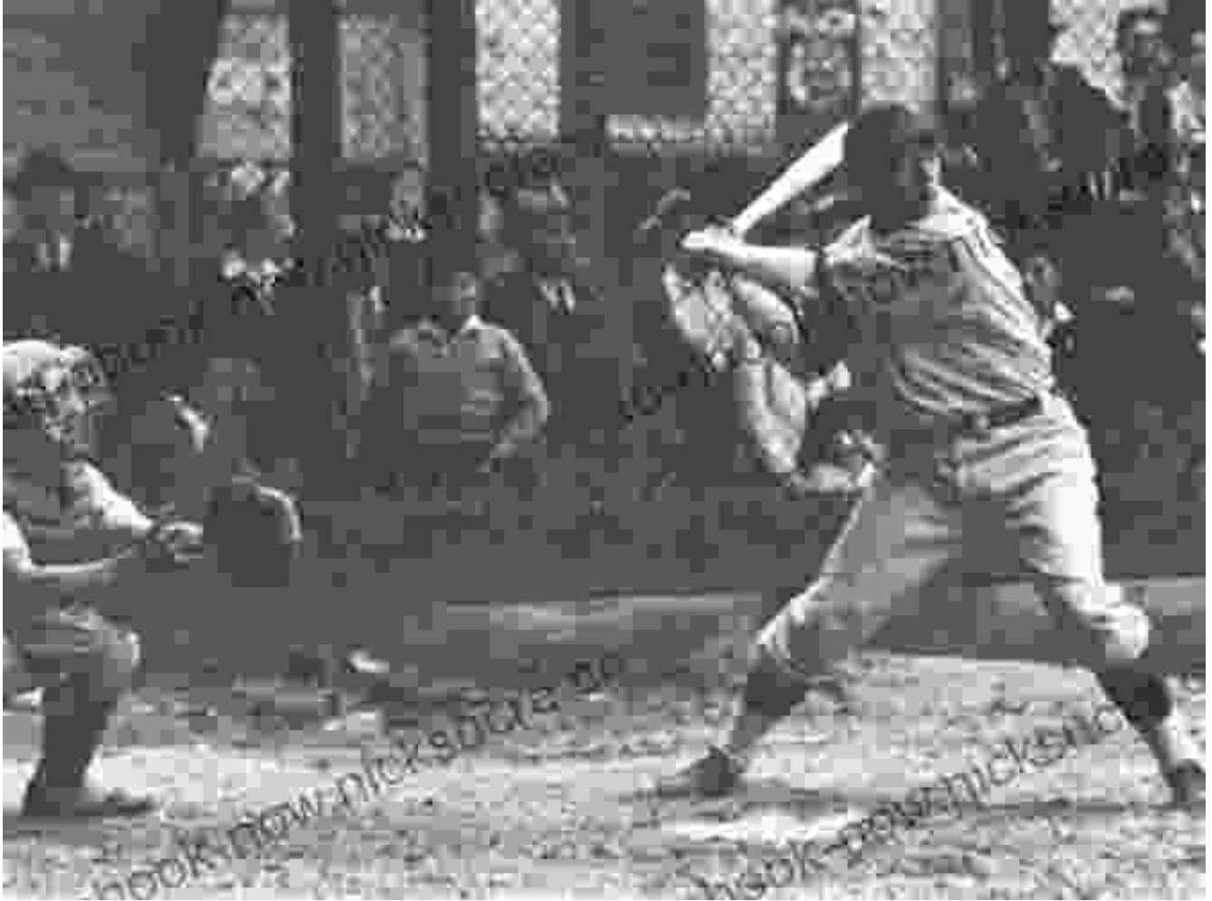
The Vancouver Asahi baseball team being interned during World War II.