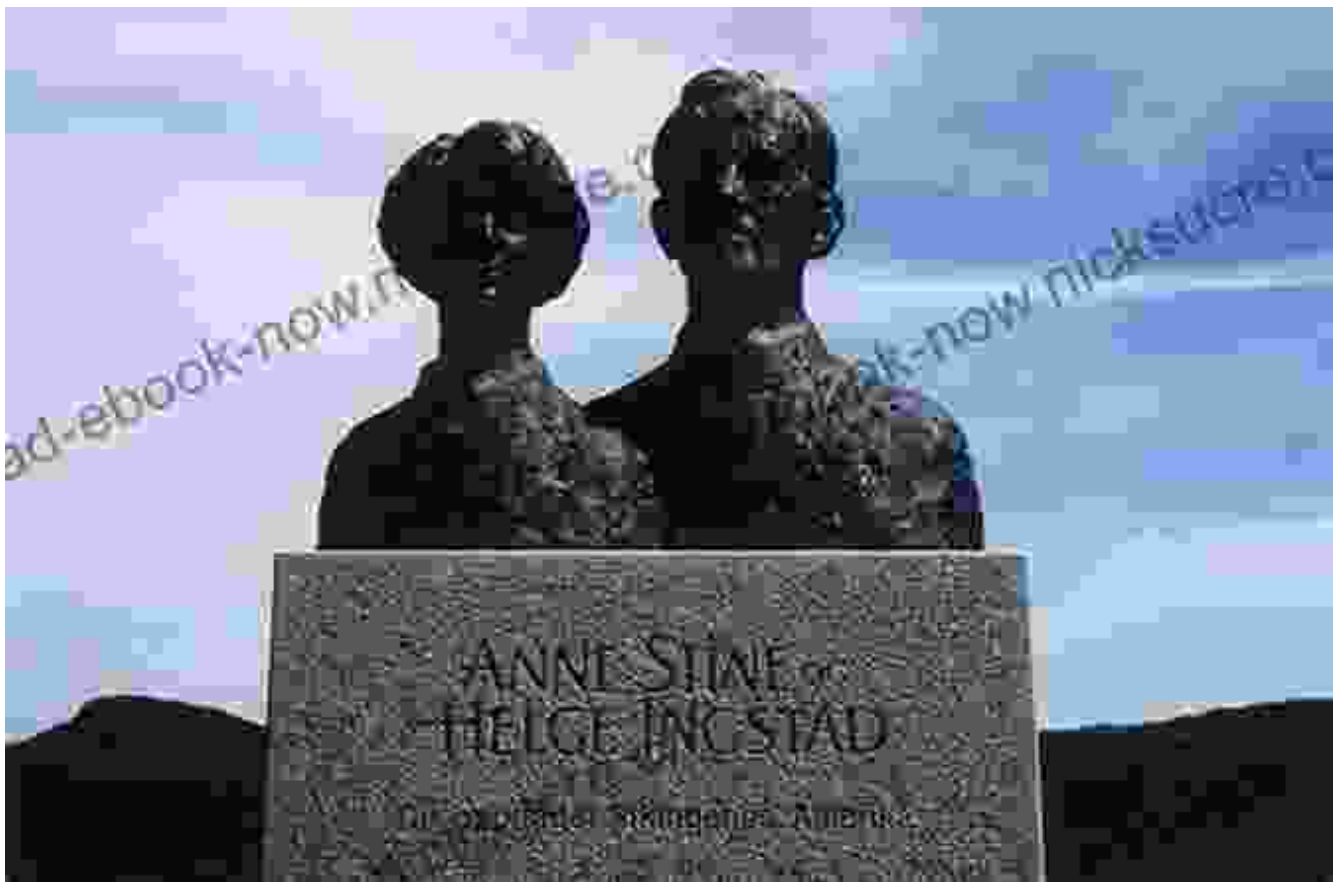
Helge and Anne Stine Ingstad at L'Anse aux Meadows

After the war, Helge and Anne Stine embarked on a series of expeditions to the Arctic. In 1949, they led a Norwegian expedition to Baffin Island in search of evidence of Viking settlements. Their groundbreaking discovery of a Viking longhouse at L'Anse aux Meadows in Newfoundland, Canada, rewrote our understanding of Viking history.