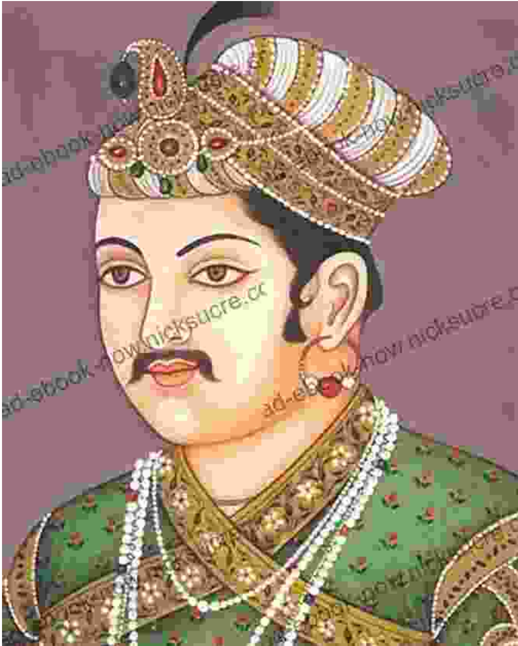
Akbar the Great, Emperor of the Mughal Empire

Akbar was born in 1542 in Umarkot, Sindh. He ascended to the throne in 1556 and ruled over a vast empire that included most of the Indian subcontinent. Akbar is considered to be one of the greatest rulers in Indian history. He was a brilliant military strategist and a skilled diplomat. He was