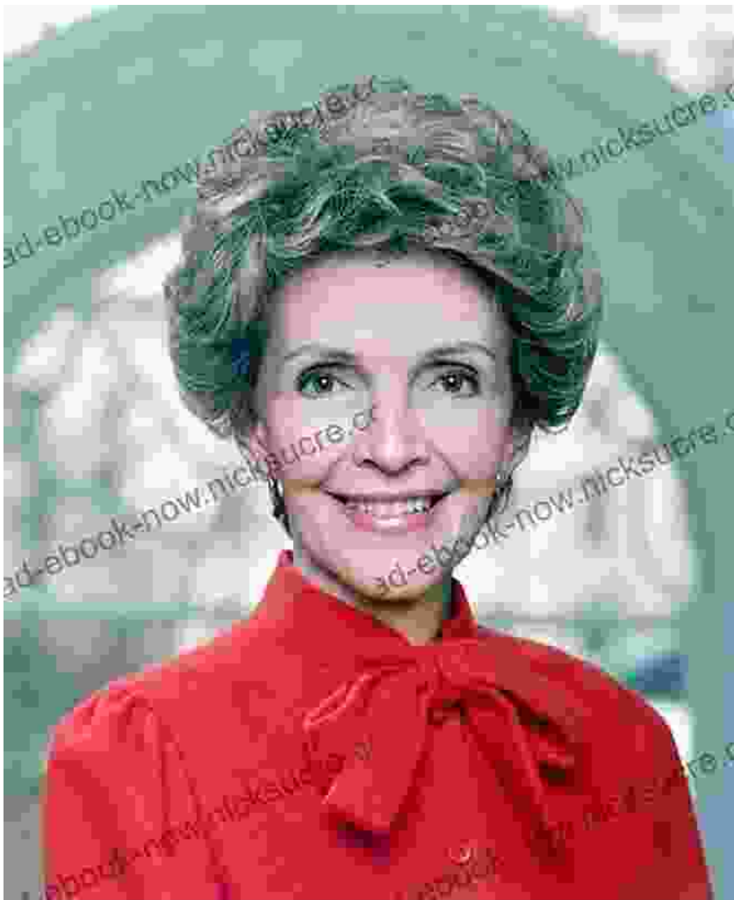
Nancy Reagan: The Unauthorized Biography by Kitty Kelley

Nancy Reagan was a controversial figure, but there is no doubt that she was a powerful and influential woman who played a major role in American politics.