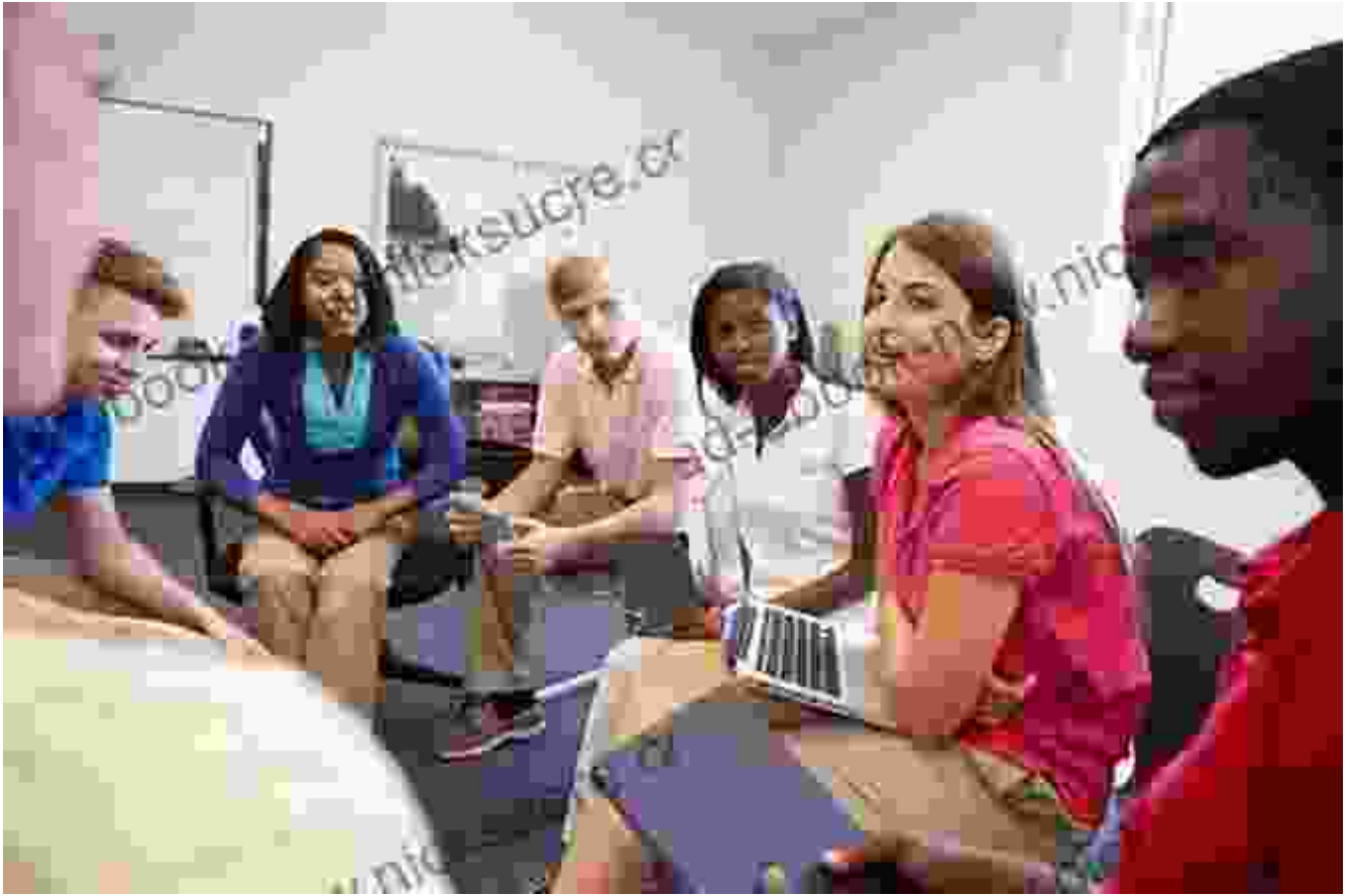
A teacher leading a discussion in the classroom