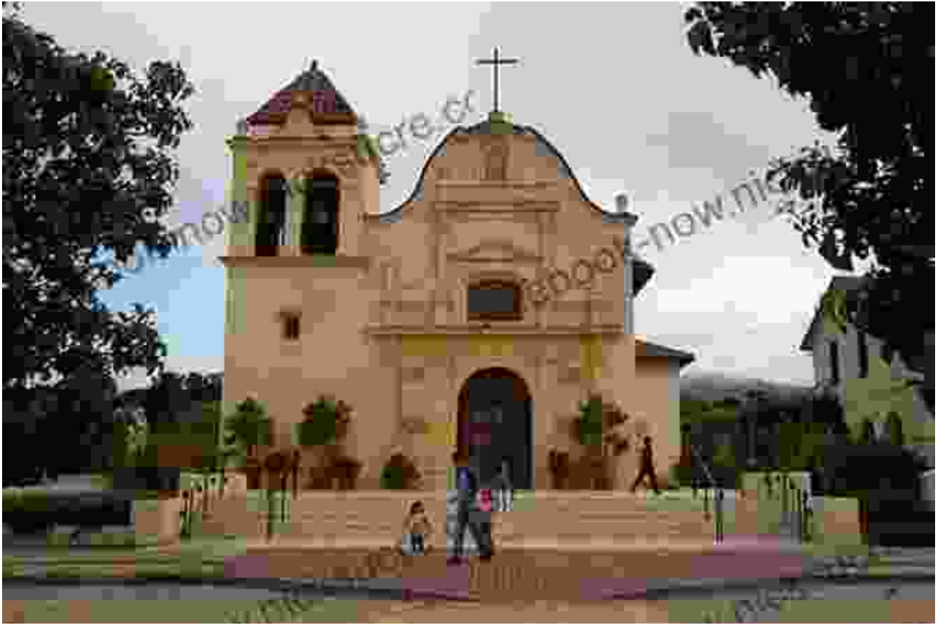
The Italian Catholic Church in Monterey, built in 1925.