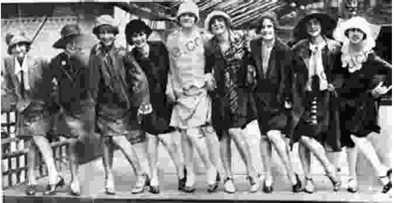
Italian women socializing in Monterey in the 1920s.