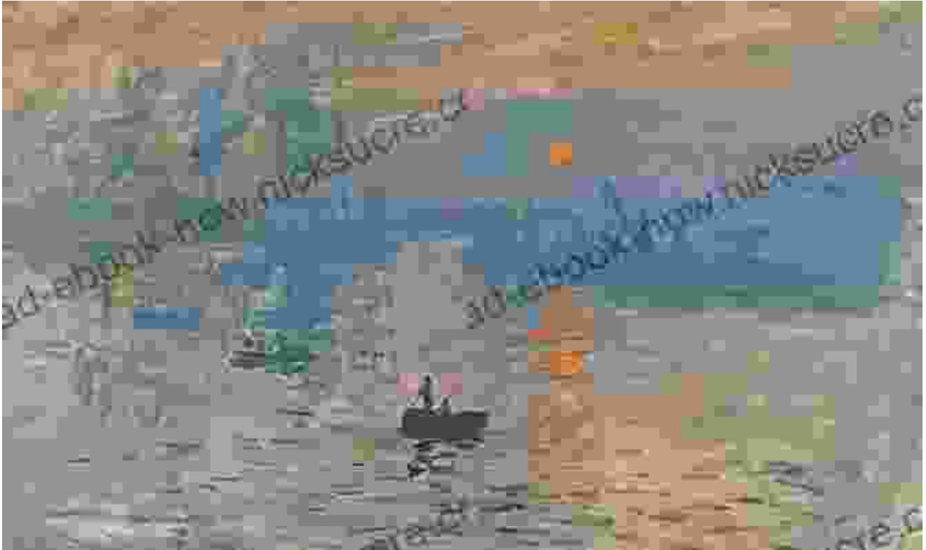
Impression, Sunrise, Claude Monet, 1872

The Louvre also houses a remarkable collection of Impressionist paintings, a movement that revolutionized art in the late 19th century. Claude Monet's Impression, Sunrise, the namesake of the movement, captures the play of light and color on the surface of the water. Its loose brushstrokes and lack of detail convey the artist's fleeting impressions of a moment in time.