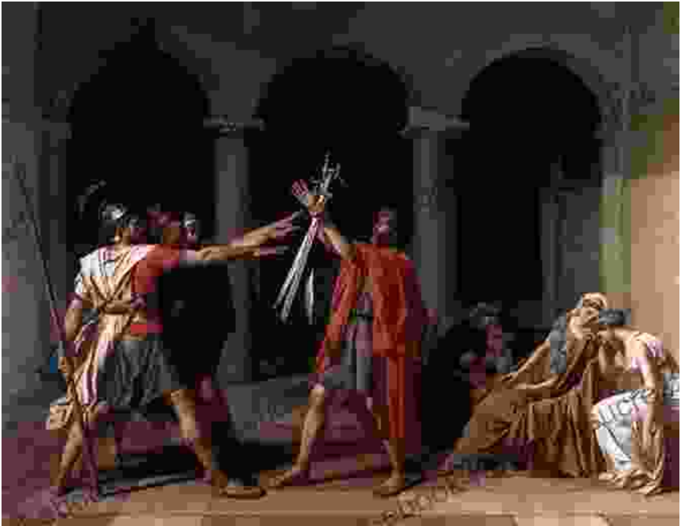
Oath of the Horatii, Jacques-Louis David, 1784

Jacques-Louis David's Oath of the Horatii epitomizes the ideals of Neoclassicism that prevailed during the French Revolution. The painting depicts the legendary oath taken by three brothers to defend their homeland, Rome. David's use of strong, linear forms and dramatic lighting