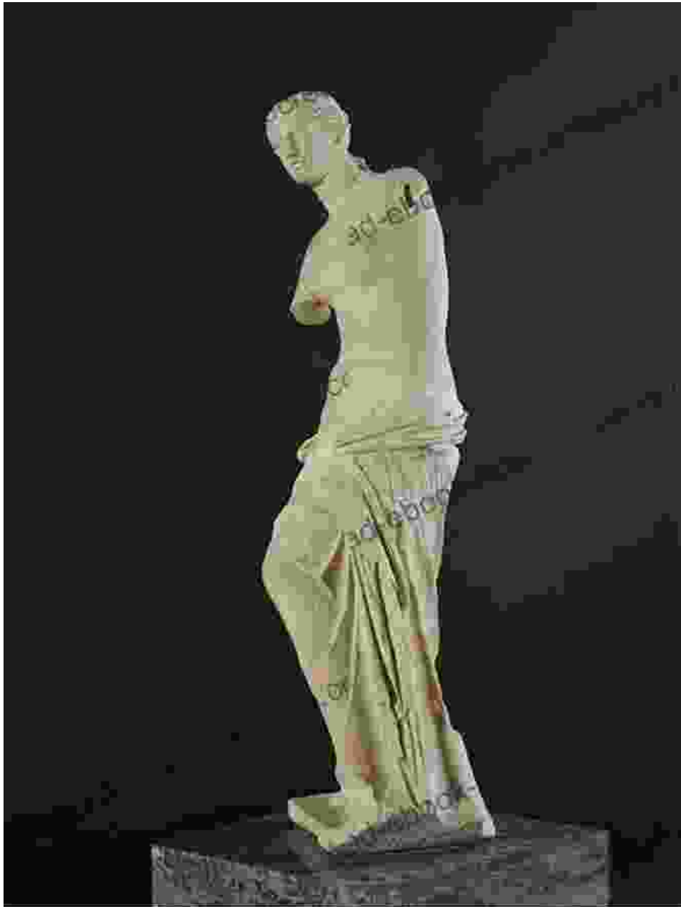
Venus de Milo, Alexandros of Antioch, c. 130 BC

The grandeur of ancient Greek sculpture is embodied in the Venus de Milo, a marble statue that depicts the goddess Aphrodite. Discovered in 1820 on the island of Milos, the statue has become synonymous with idealized