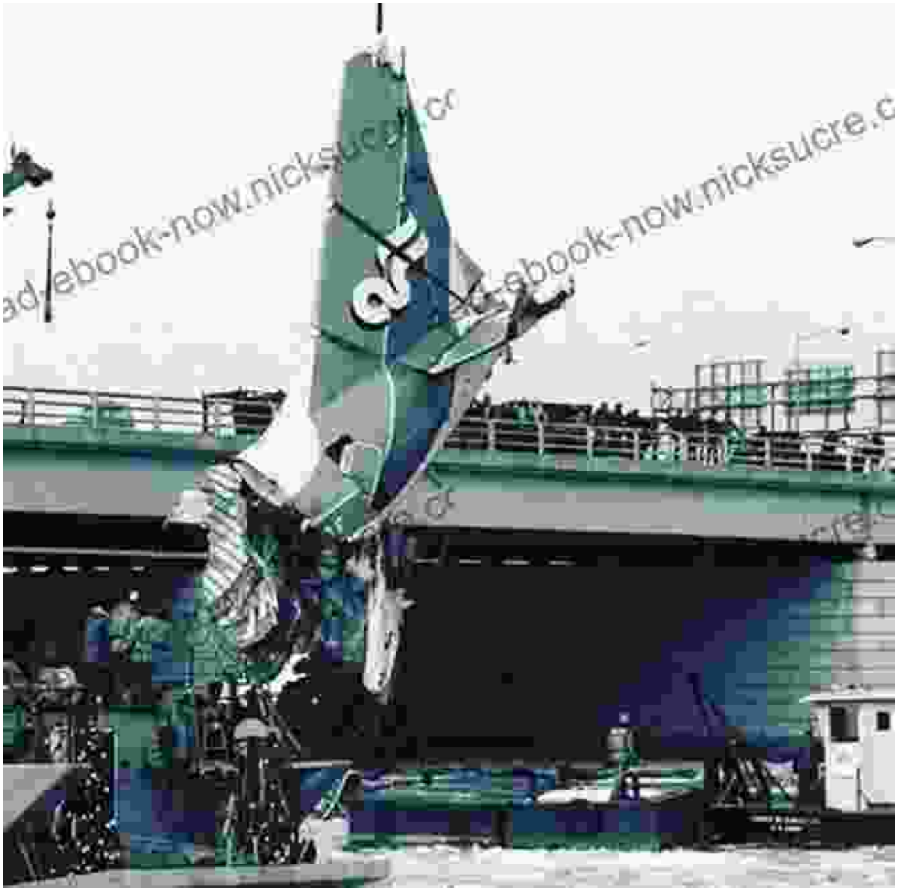
The crash site of Angel Flight 82.